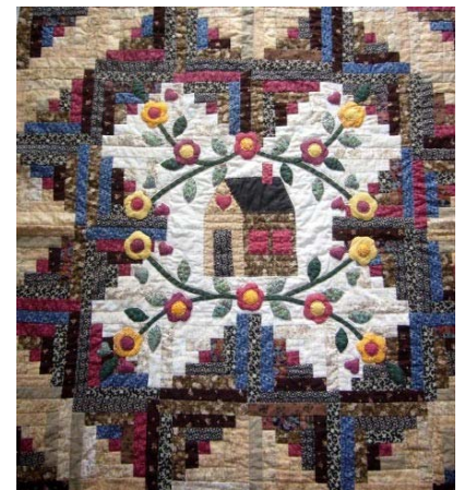
This quilt wall hanging could be yours!